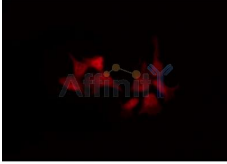
AF8102 staining SW626 by IF/ICC. The sample were fixed with PFA and permeabilized in 0.1% Triton X-100, then blocked in 10% serum for 45 minutes at 25°C. The primary Ab was diluted at 1/200 and incubated with the sample for 1 hour at 37°C. An Alexa Fluor 594 conjugated goat anti-rabbit IgG (H+L) Ab, diluted at 1/600, was used as the secondary Ab.

IMPORTANT: For western blot, incubate membrane with diluted Ab in 5% w/v milk, 1X TBS, 0.1% Tween@20 at 4°C with gentle shaking, overnight.